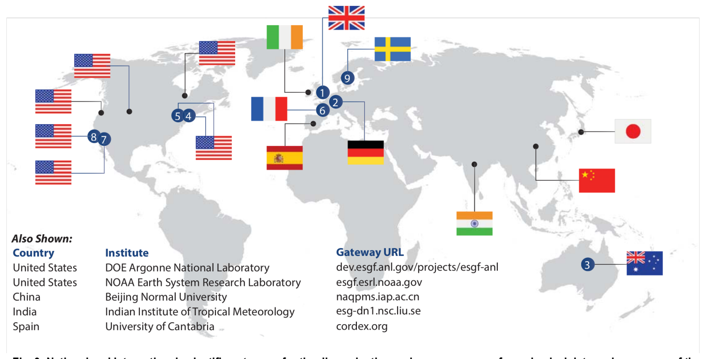
Fig. 3. National and international scientific gateways for the dissemination and secure access of geophysical data and resources of the ESGF peer-to-peer enterprise system. This ESGF collaboration develops, deploys, and maintains software infrastructure for the management, dissemination, and analysis of model output and observational data. As illustrated by the breadth of projects and geographical reach, ESGF supports a broad range of activities that require ongoing access to a full spectrum of Earth system science data.